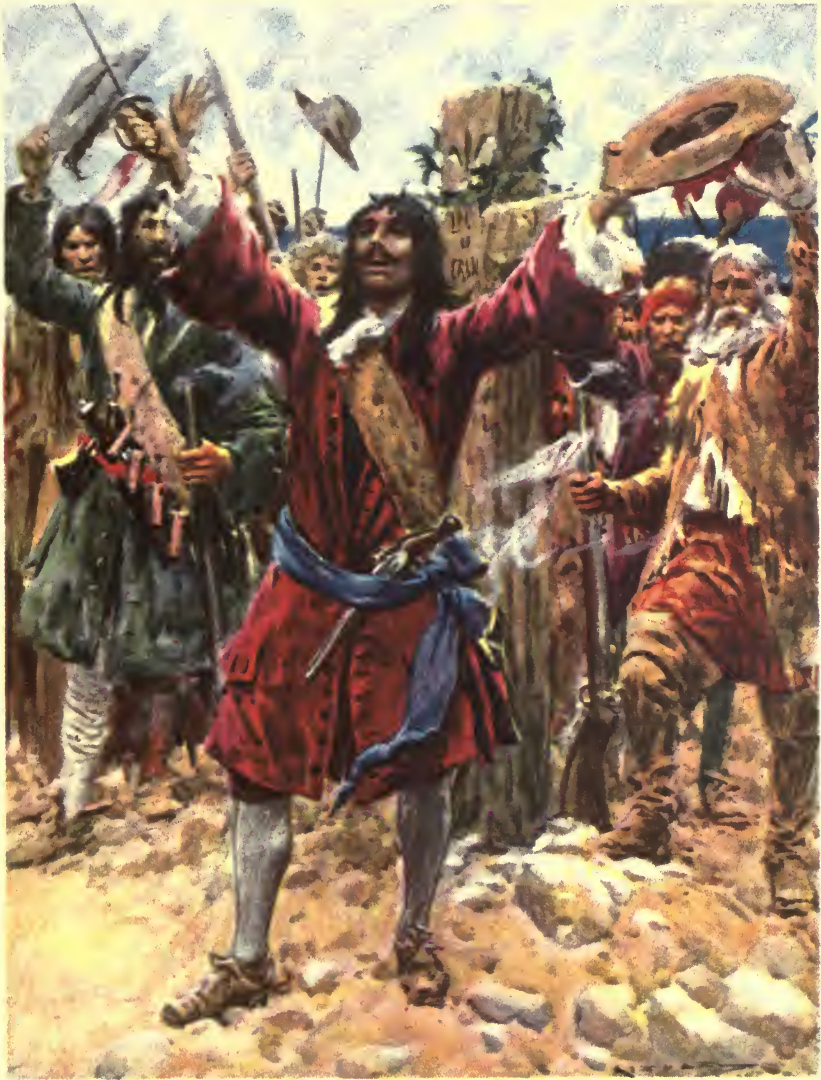
LA SALLE TAKES POSSESSION OF LOUISIANA

"In the Name of the most high, mighty, invincible, and victorious Prince Louis the Great, by the Grace of God, King of France and Navarre . . . I do now take possession of this country of Louisiana."